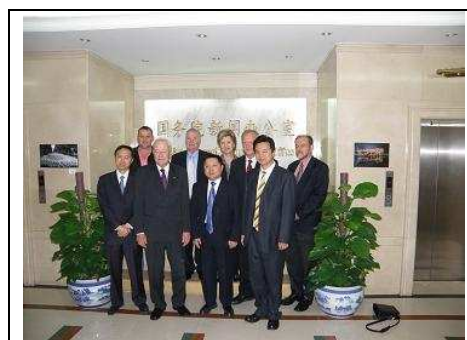
Delegation and Deputy Minister Wang, State Council Information Office

Deputy Minister Wang Zhongwei, State Council Information Office of the P.R.China received 2010 International Mission to China. Please find more at: http://www.aita.com.cn/ArticleShow.asp?ID=1232&Language=2 or http://www.scio.gov.cn/