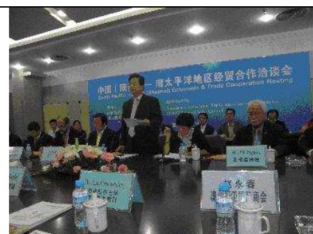
Shanxi Economy Forum