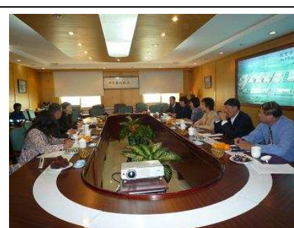
Visit Water Group Beijing