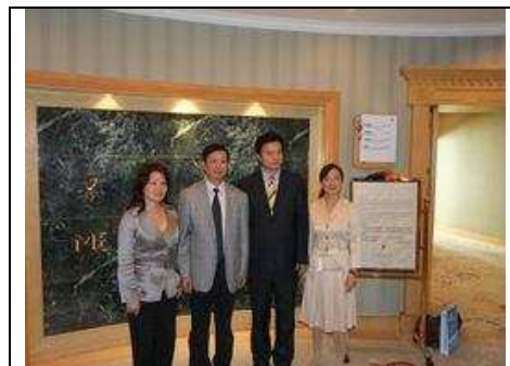
Meeting Yangzhou CPIT