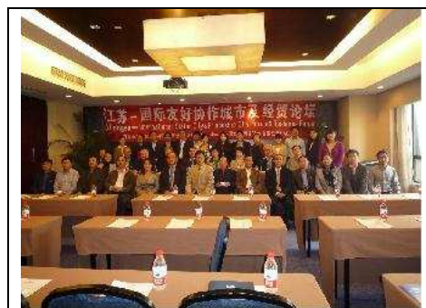
Jiangsu Friendship City

Organized by AITA & Associates and Jiangsu Provincial People's Government, Jiangsu - International Sister City & Friendship City Forum & Business Forum, not only promote community friendship, but facilitated in business development and stimulation of ideas. Please find more at: http://www.aita.com.cn/ArticleShow.asp?ID=1242&Language=2