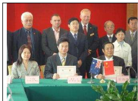
Assist Minister sign contract with AITA & Associates