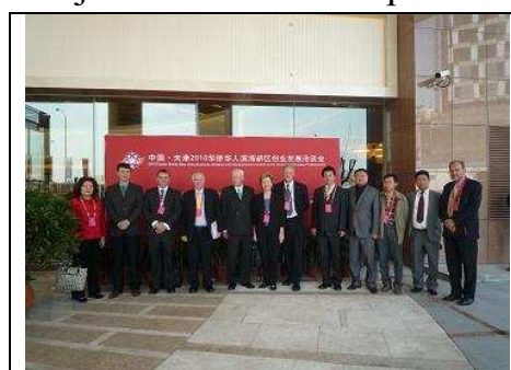
Tianjin Commerce Commission with delegation

Commerce Commission of Tianjin Municipal Government and AITA & Associates hosted "Tianjin,China and Australia (Aisa Pacific) Economy and Trade project forum" to promote government, commercial and trade associations cooperation in all aspects, to achive in"walk to international, welcome our guests" Minister of Commerce Commission of Tianjin Government and leader of delegation addressed to the forum. More than 30 companies from Tianjin export, mining, fiances, education, real estate, manufacturing and public infastruction attened forum. Please find more at: http://www.aita.com.cn/ArticleShow.asp?ID=1226&Language=2