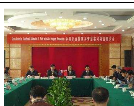
Henan Education & Business Forum