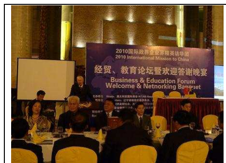
Ambassador of Samoa in the Evening function

Tapusalala Terry Toomata Ambassador of Samoa attended networking and function banquet of 2010 International Mission to China. Please find more at: http://www.aita.com.cn/ArticleShow.asp?ID=1229&Language=2