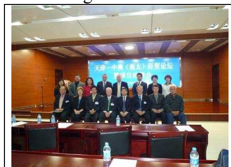
Tianjin Economy and Trade Forum