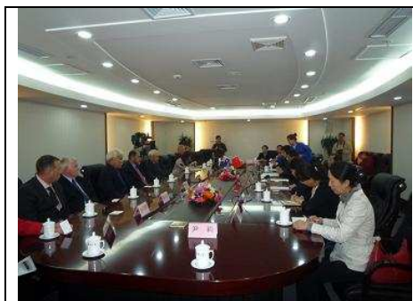
Changping peoples Government, Beijing meeting Delegation