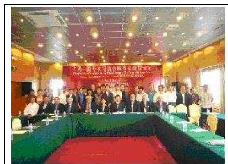
Shanghai Economy Forum

Organized by AITA & Associates and Shanghai Municipal Government, many Shanghai business executives and government officials have attended Shanghai - International Sister City & Friendship City Forum & Business Forum to promote business and friendship