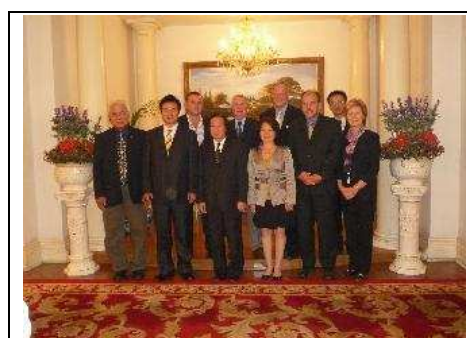
Deputy Minister Mr. Xu, Foreign Affairs of Jiangsu with delegat

Please find out more at: http://www.aita.com.cn/ArticleShow.asp?ID=1241&Language=2 or http://www.jsfao.gov.cn